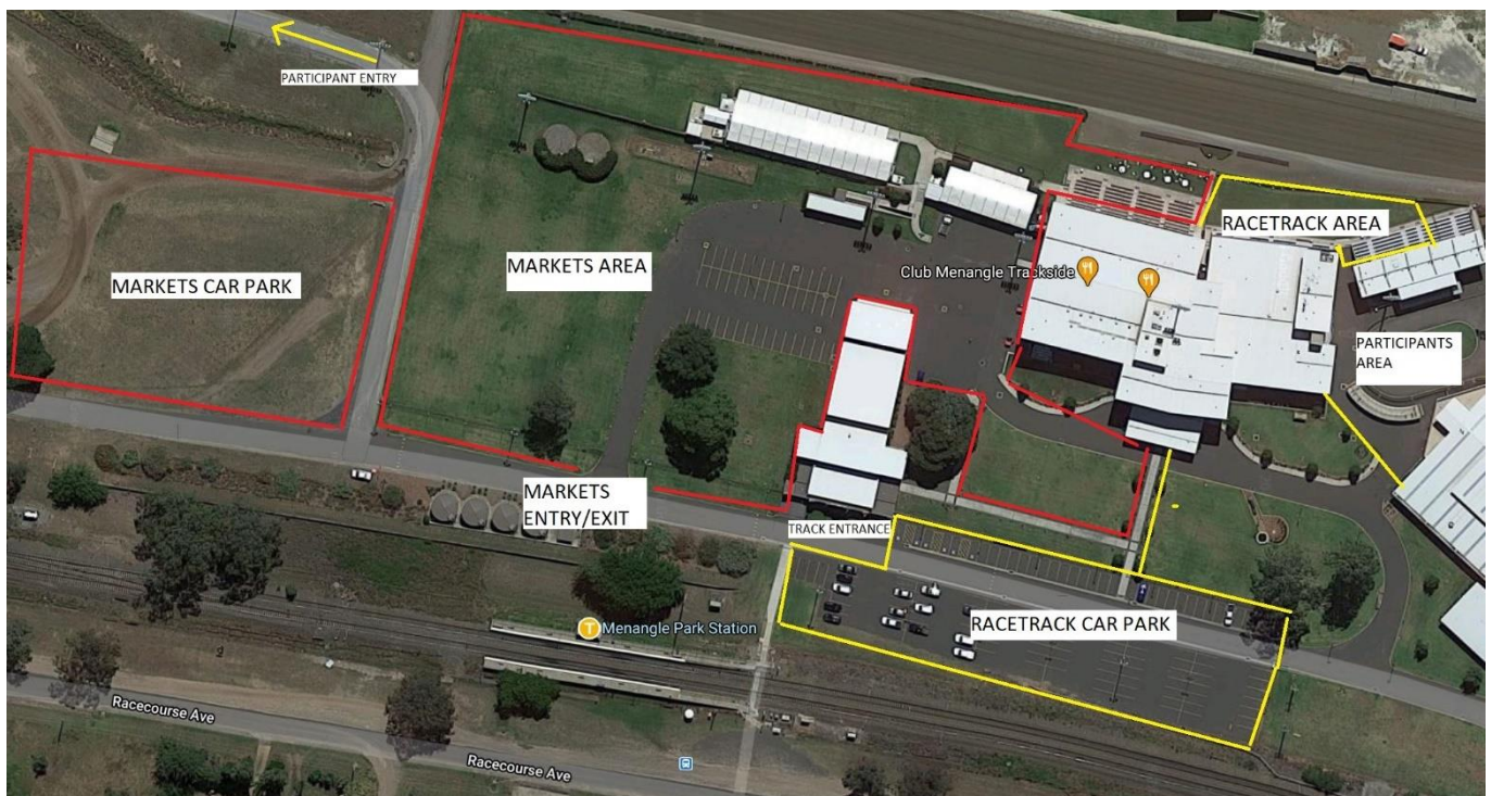
Figure 2. Separation between markets guests and racetrack guests.

Separate car parks and entry points will be used for market customers and racetrack guests to avoid congestion.