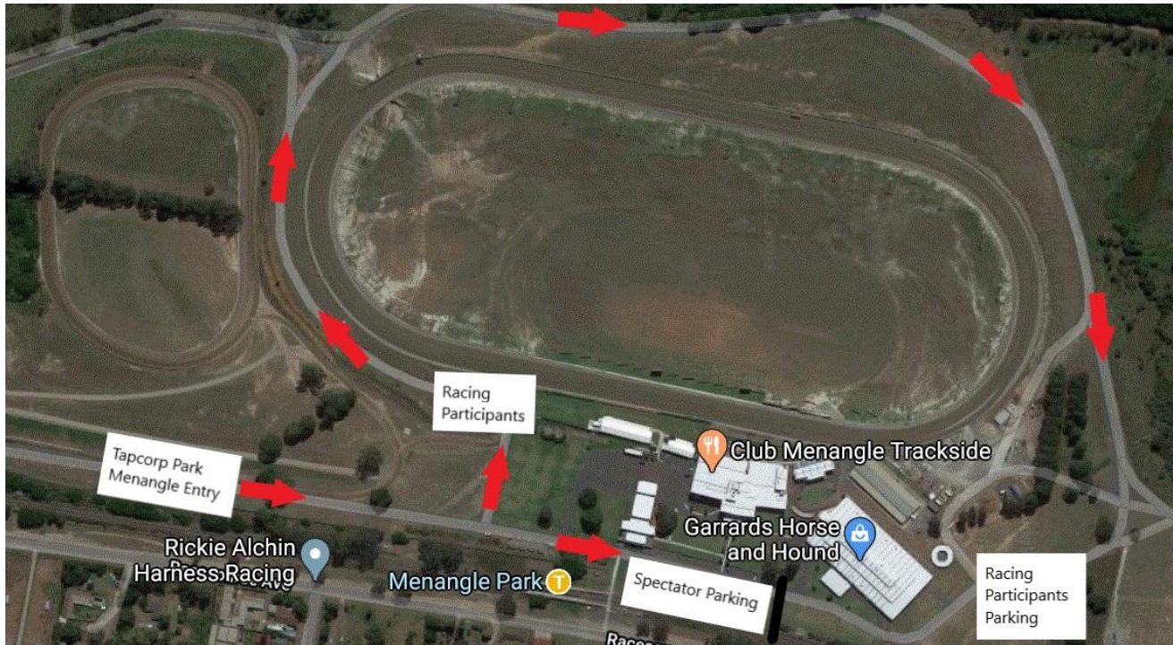
Figure 3. Entry to Premises

Racing Participants and Spectators will be separated before the Club Menangle Admin building. Racing participants will travel around the back of the main track to their car park at the rear of the stable area. Spectators will continue to the main carpark