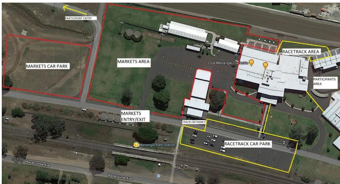
Figure 2. Separation between markets guests and racetrack guests.

Total capacity of the markets is 7,598 reflected in the total publicly accessible external area detailed in Figure 1.