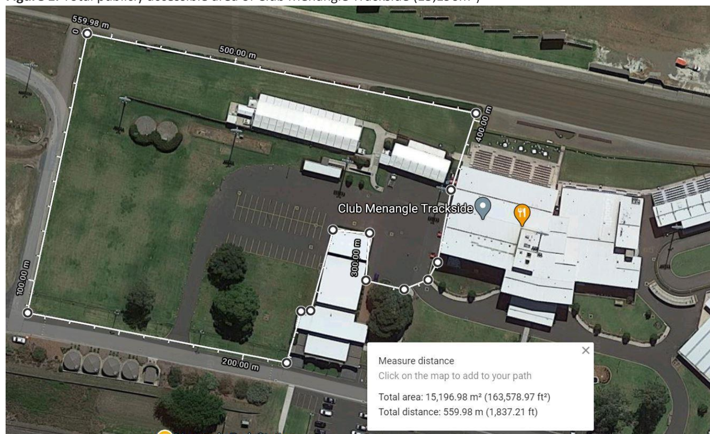
Figure 1. Total publicly accessible area of Club Menangle Trackside (15,196m 2 )

The one person per 4 square metre rule will be re-introduced for all indoor settings including hospitality venues and places of worship.