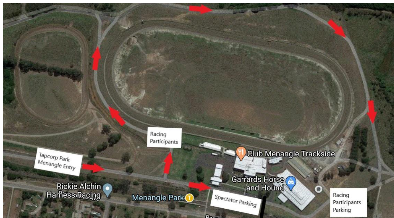
Figure 3. Entry to Premises

Racing Participants and Spectators will be separated before the Club Menangle Admin building. Racing participants will travel around the back of the main track to their car park at the rear of the stable area. Spectators will continue to the main carpark