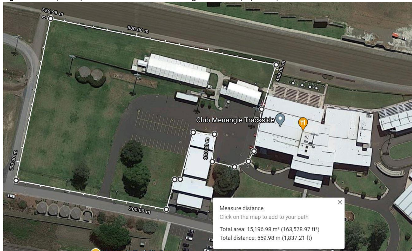
Figure 1. Total publicly accessible area of Club Menangle Trackside (15,196m 2 )

Club Menangle Trackside will operate 4 different internal areas at race meetings, classified as Food and Beverage Premises.