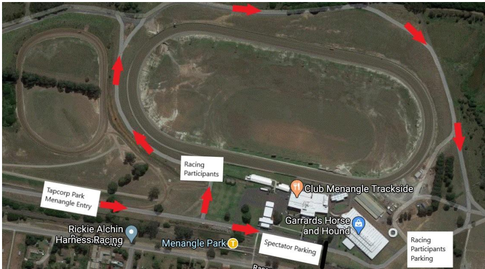
Figure 3. Entry to Premises

Figure 4 illustrates the 3 separate zones of control for persons on site. Entrants will be required to check in via the Service NSW app to the respective area, there are separate QR codes for both the spectator and participant zones.