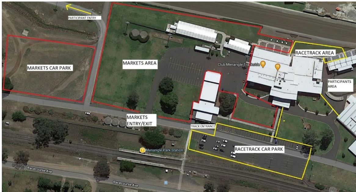
Figure 2. Separation between markets guests and racetrack guests.