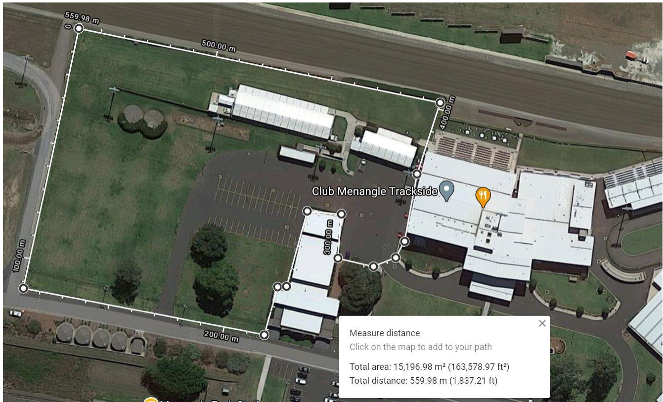
Figure 1. Total publicly accessible area of Club Menangle Trackside (15,196m 2 )

Club Menangle Trackside will operate 4 different internal areas at race meetings, classified as Food and Beverage Premises.